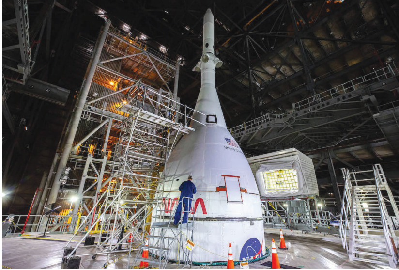
The Orion spacecraft, with its launch abort system, stands on top of NASA's Space Launch System rocket inside the VAB.

The mission, called Artemis 1, will send the Orion spacecraft to the moon, where it will enter a distant orbit in a multi-week, unpiloted "shakedown cruise" to demonstrate the SLS rocket and Orion are ready to carry astronauts. The next mission, known as Artemis 2, will send a crew